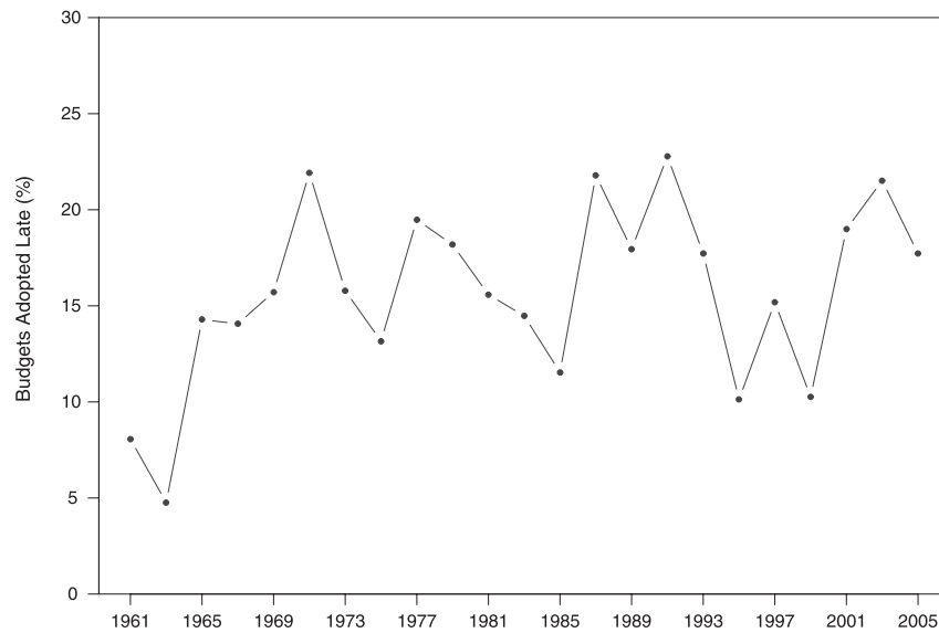
FIGURE 1 Frequency of Late State Budgets: 1961-2006

Note: This graph depicts the share of budgets that are adopted late per biennium. Each biennium begins with an odd-numbered year. This means, for example, that the point plotted for 1961 shows the share of budgets that were adopted after the start of the fiscal year in both 1961 and 1962. For states that budget annually, data are pooled across the two years that constitute the biennium.